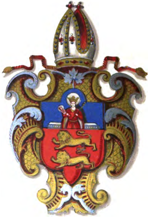
BISHOPRIC SEAL OF