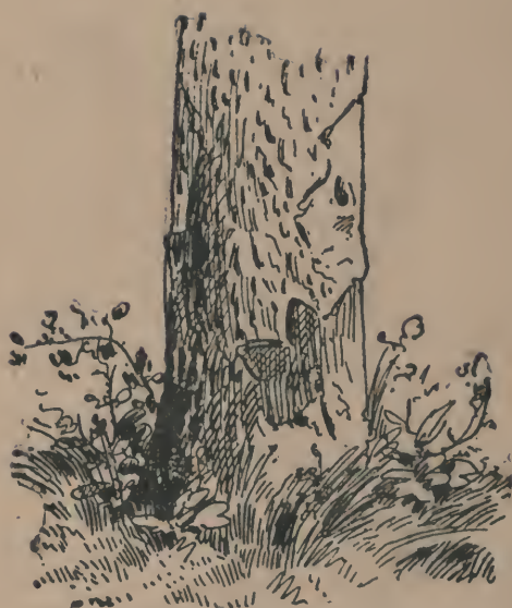
A BATTLE-SCARRED OAK.