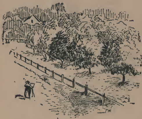
PRESENT SITE OF PROPHET'S TOWN.

number of horses belonging to settlers were stolen. They were tracked to the town of Tippecanoe and were surrendered to the searching company, but were retaken by the Indians who appeared to regret that they had delivered them to the whites.