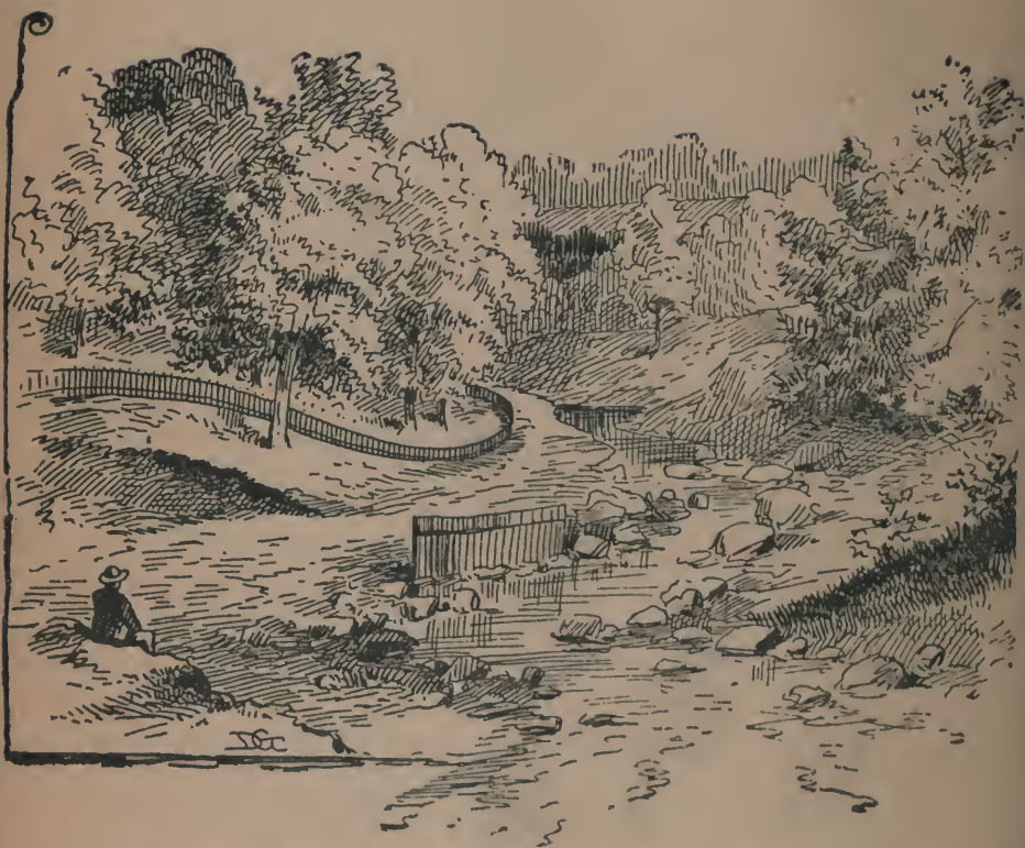
BURNETT'S CREEK AND BATTLE GROUND. FROM THE WEST.