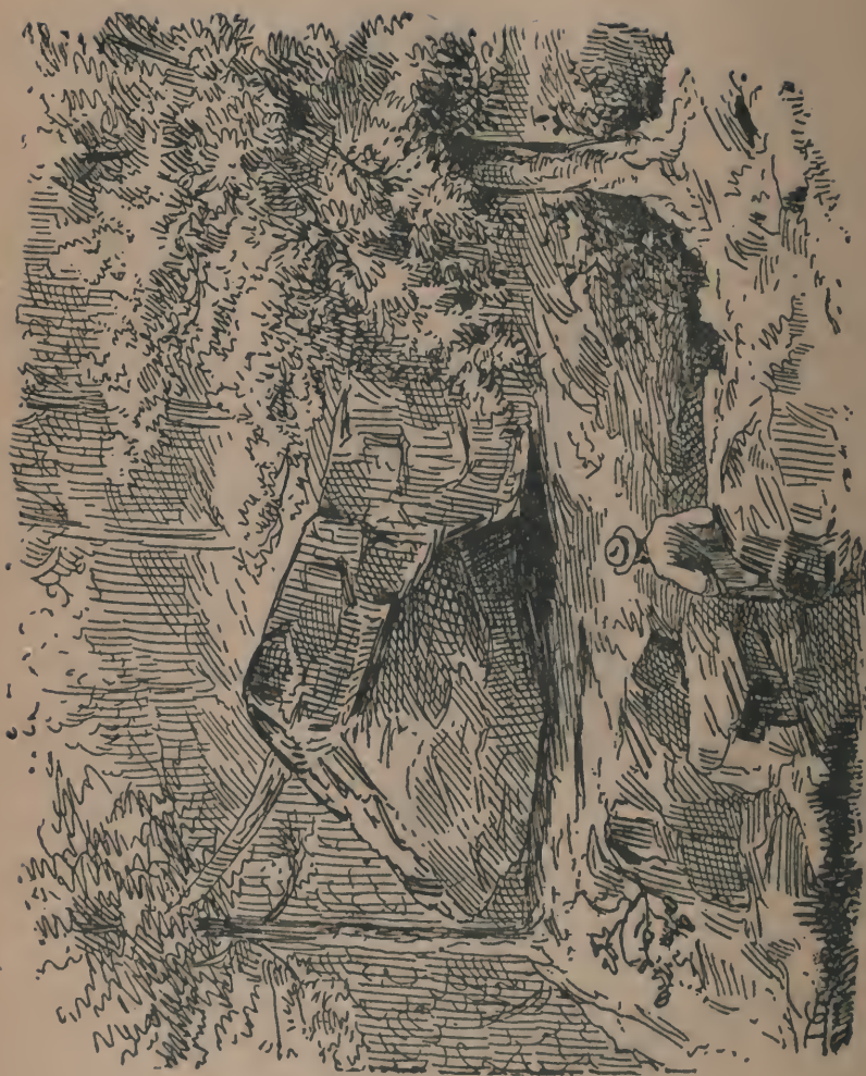
PROPHET'S ROCK AND RATTLE-SNAKE CAVE.