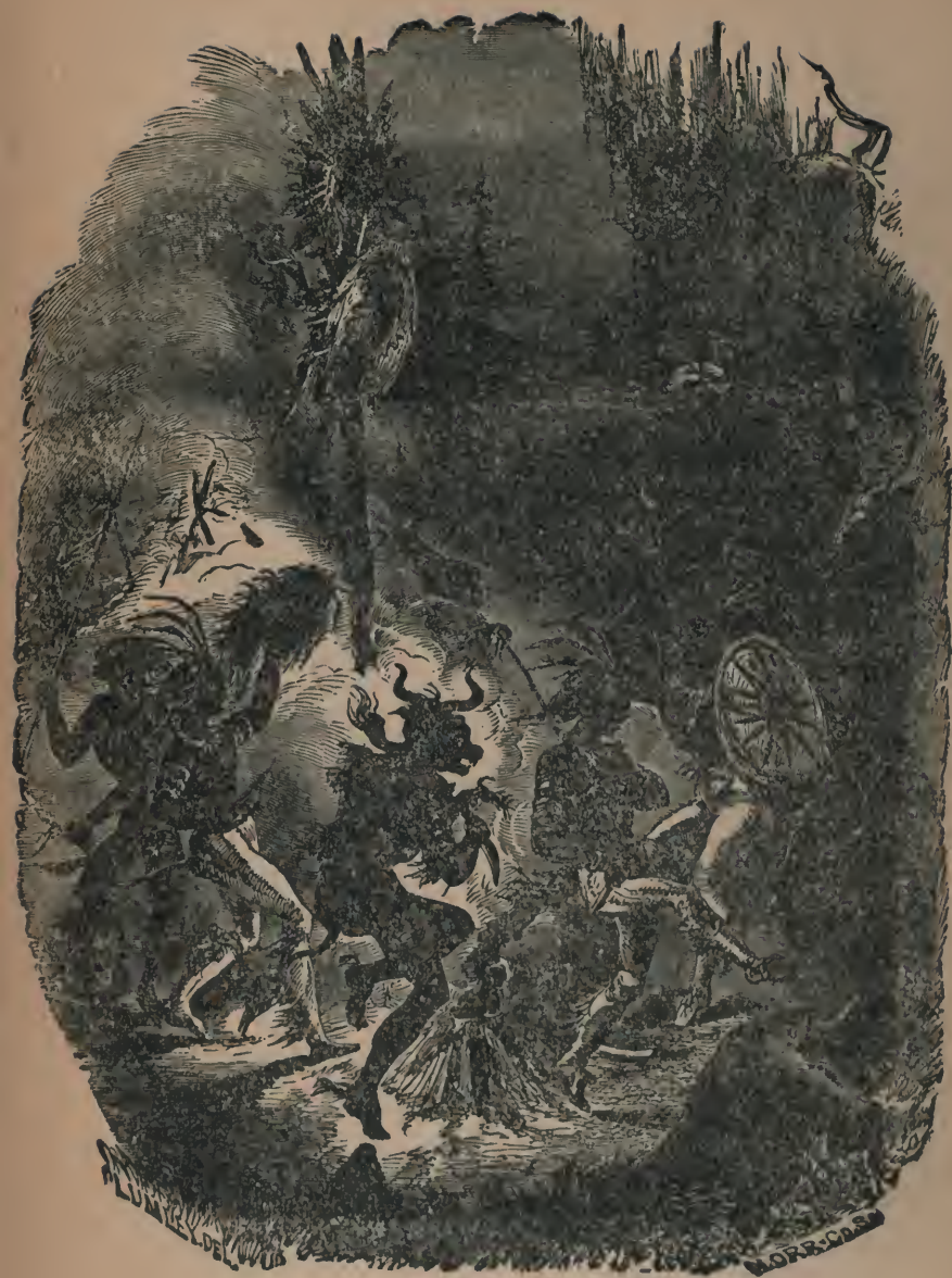
INDIAN WAR DANCE.

[From Famous Frontiersmen. Pioneers and Scouts; published by W. H. Harrison, Jr., Publishing Co., Chicago.]