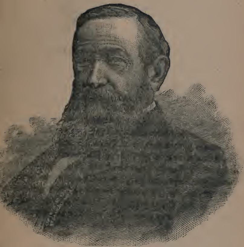
GENERAL BENJAMIN HARRISON.